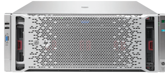
HP ProLiant DL580 Gen8 Server